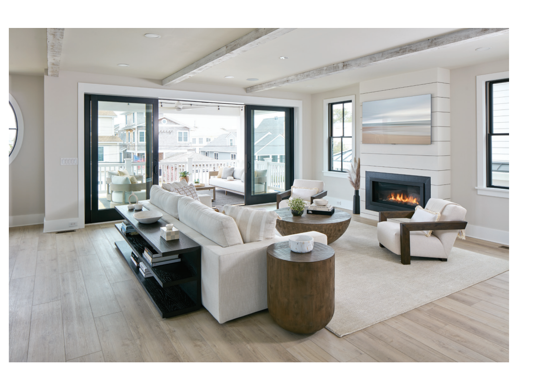
UNIQUELY COASTAL The home's modern, neutral palette strays from typical seaside colors, yet finishes like shiplap and creative surfing inclusions are nods to its location, just a short walk from the beach.

A shower at the side of the house is positioned next to an entry, and the first floor includes a washer/dryer and mudroom with a beach-prep nook. "We are a one-minute walk to the beach, so you can throw your stuff in the garage, take a shower and dip into the side of the house," Mike said.