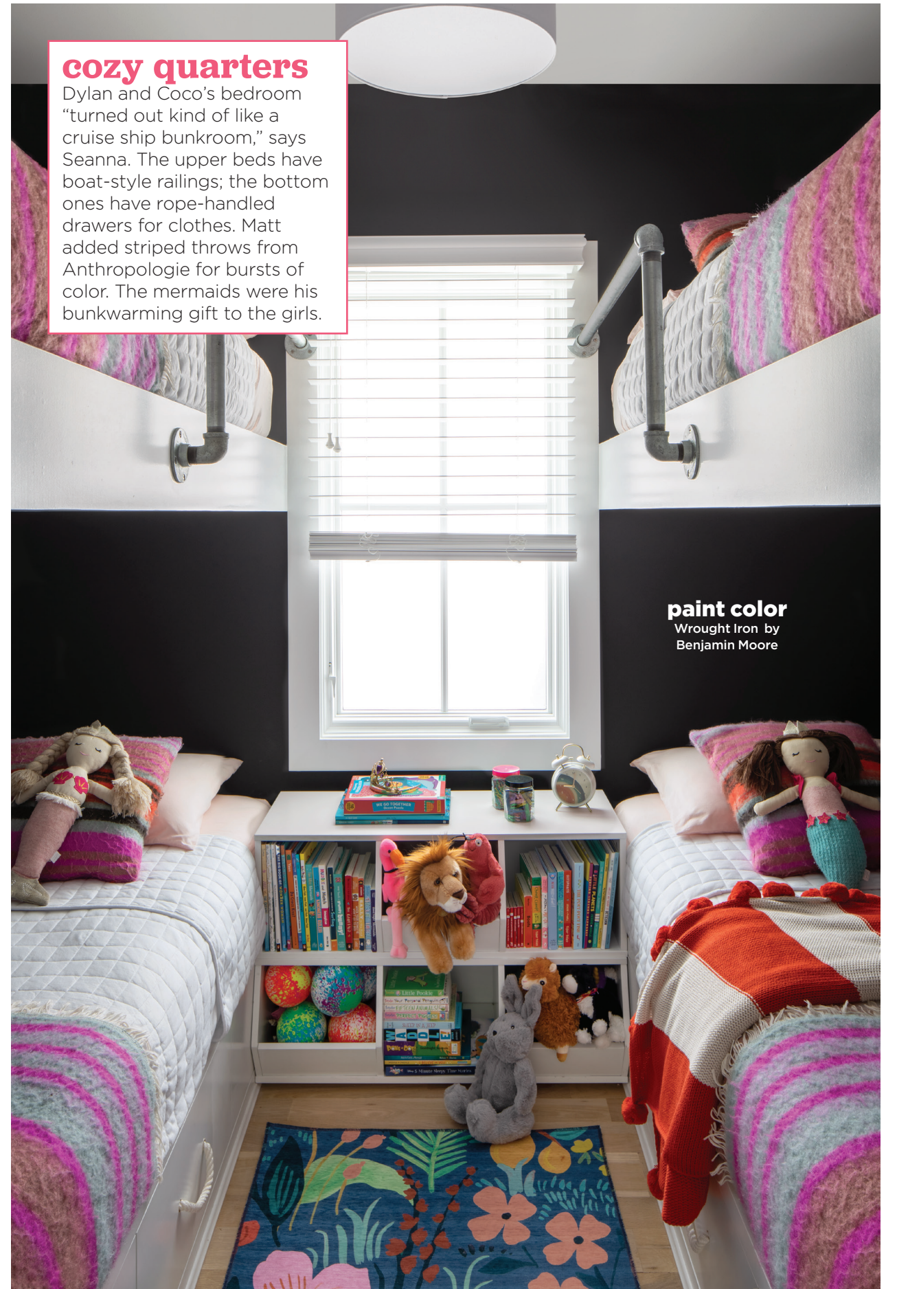
cozy quarters Dylan and Coco's bedroom "turned out kind of like a cruise ship bunkroom," says Seanna. The upper beds have boat-style railings; the bottom ones have rope-handled drawers for clothes. Matt added striped throws from Anthropologie for bursts of color. The mermaids were his bunkwarming gift to the girls.