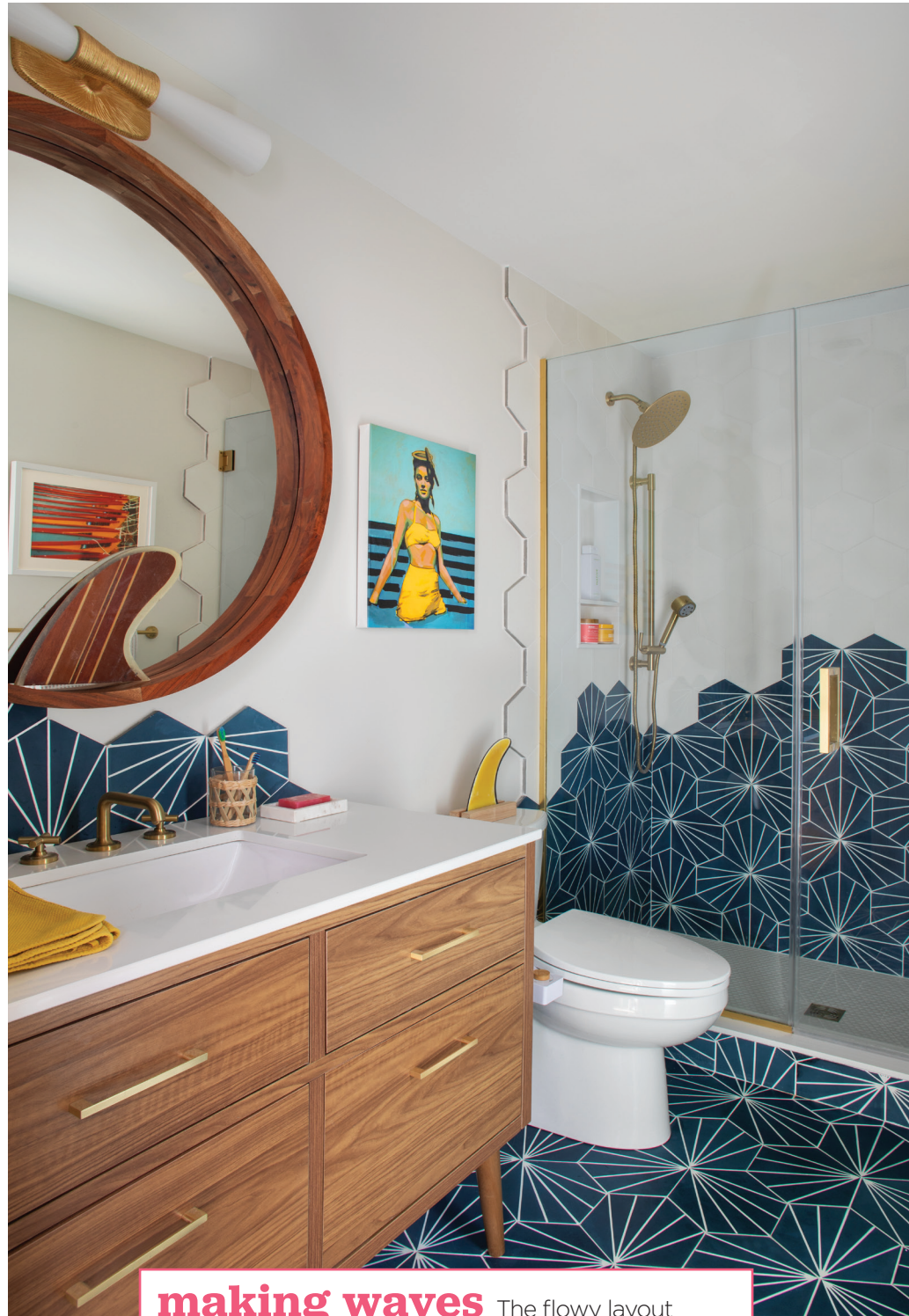
making waves The flowy layout of Clé tiles in the shower creates the illusion of movement in the primary bathroom. An old surfboard fin on the CB2 mirror and a pop-art painting of a snorkeling girl keep the theme going.