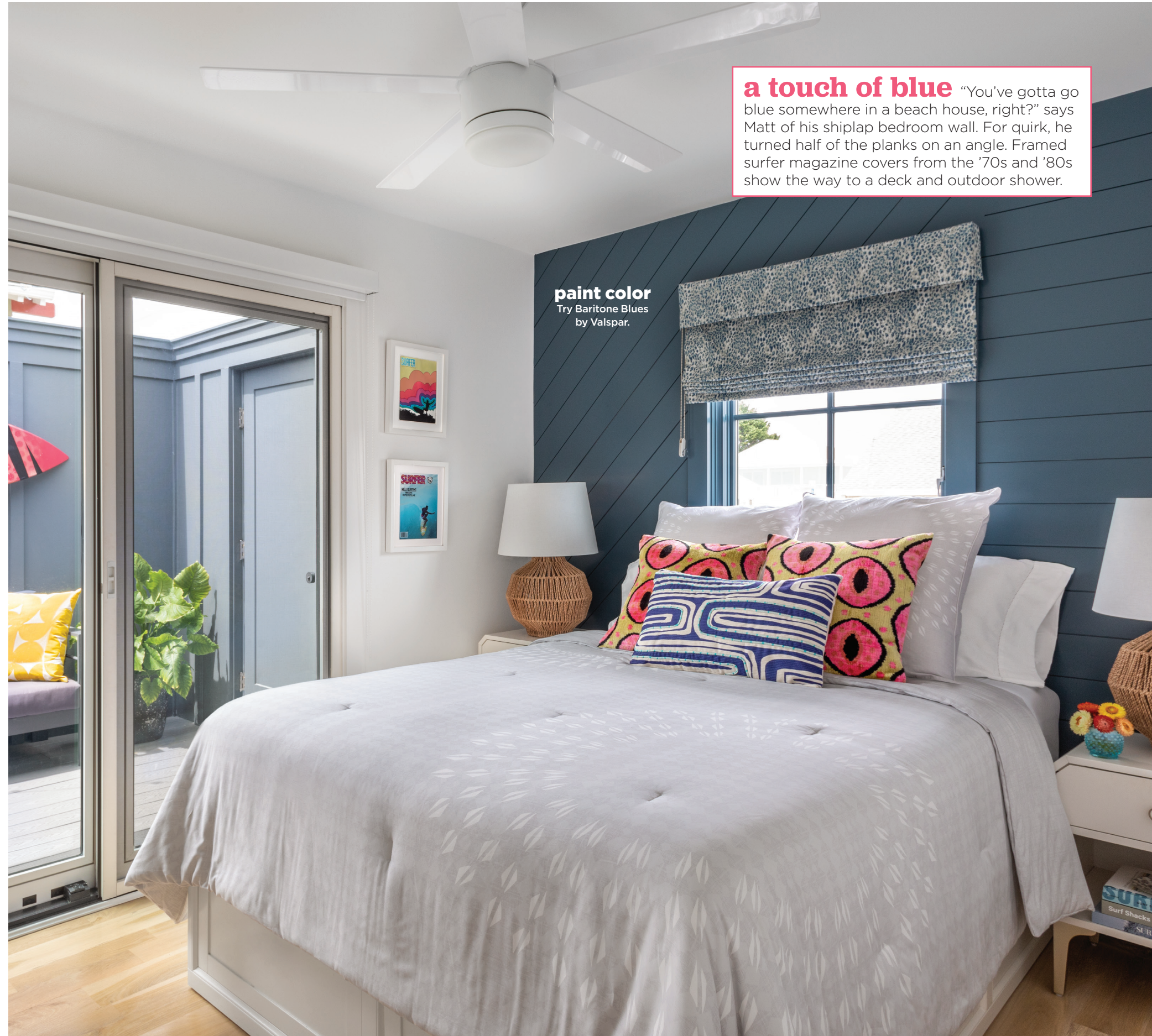
a touch of blue “You’ve gotta go blue somewhere in a beach house, right?” says Matt of his shiplap bedroom wall. For quirk, he turned half of the planks on an angle. Framed surfer magazine covers from the ‘70s and ‘80s show the way to a deck and outdoor shower.

paint color Try Baritone Blues by Valspar.